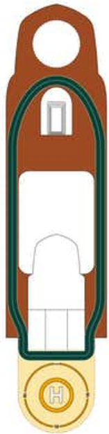
DECK 8 Walking / running track Helicopter Pad