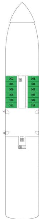
DECK 3 Staterooms Mud Room Expedition Tender Medical Center Guests' Locker Room