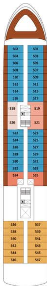
DECK 5 Staterooms Bow Observation Deck