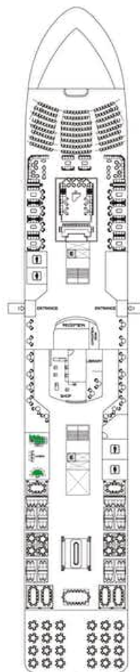
DECK 4 Lecture Hall / Theatre Explorer Lounge + Bar Library/Chart Room Boutique Main Restaurant Reception Guest Relations - Expedition Desk Casino